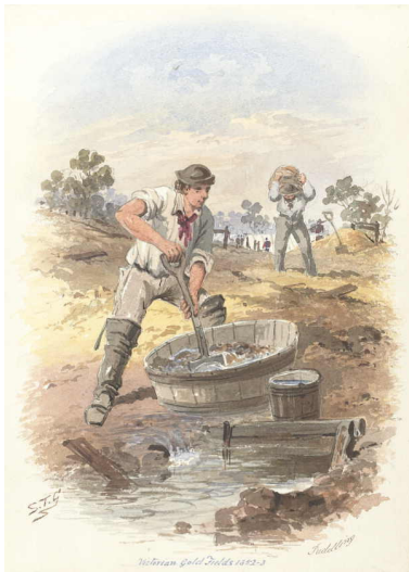
Puddling by S T Gill

After 1870, Gill fell into obscurity. He did, however, continue to produce work, some of it in the nature of cartoons. On 27 October 1880, he collapsed in Post Office Place, Melbourne, and was found to be dead when taken to hospital. His grave in the Melbourne General Cemetery was unmarked until 1913 when his body was moved to a private plot in the same cemetery and a stone erected. This was paid for by funds collected by the Historical Society of Victoria. Gill never married.